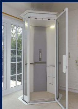
Lifestyle Home Lift

For further information or to book your free home survey, call us today on 0345 365 5366 or visit www.terrylifts.co.uk to view our full range of home lifts