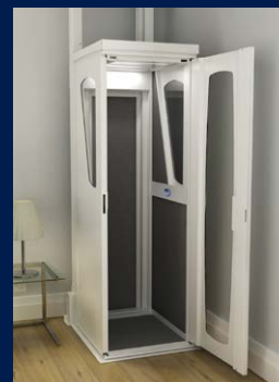
Vivendi Home Lift